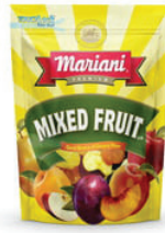
Mariani Dried Fruit, Mixed, 32oz