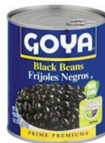
Goya Black Beans Can, 29oz