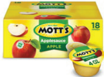
Mott's Applesauce Cups, 4oz, 18ct