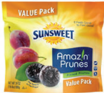
Sunsweet Amazin, Pitted Prunes, 24oz