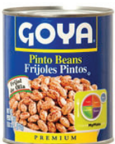
Goya Pinto Beans Can, 29oz