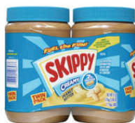
SKIPPY Creamy Peanut Butter Spread, 40oz, 2ct