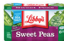
Libby's Sweet Peas Can, 15oz, 6ct